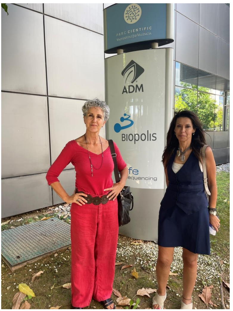
ICHTHYS project secondment, Valencia Spain