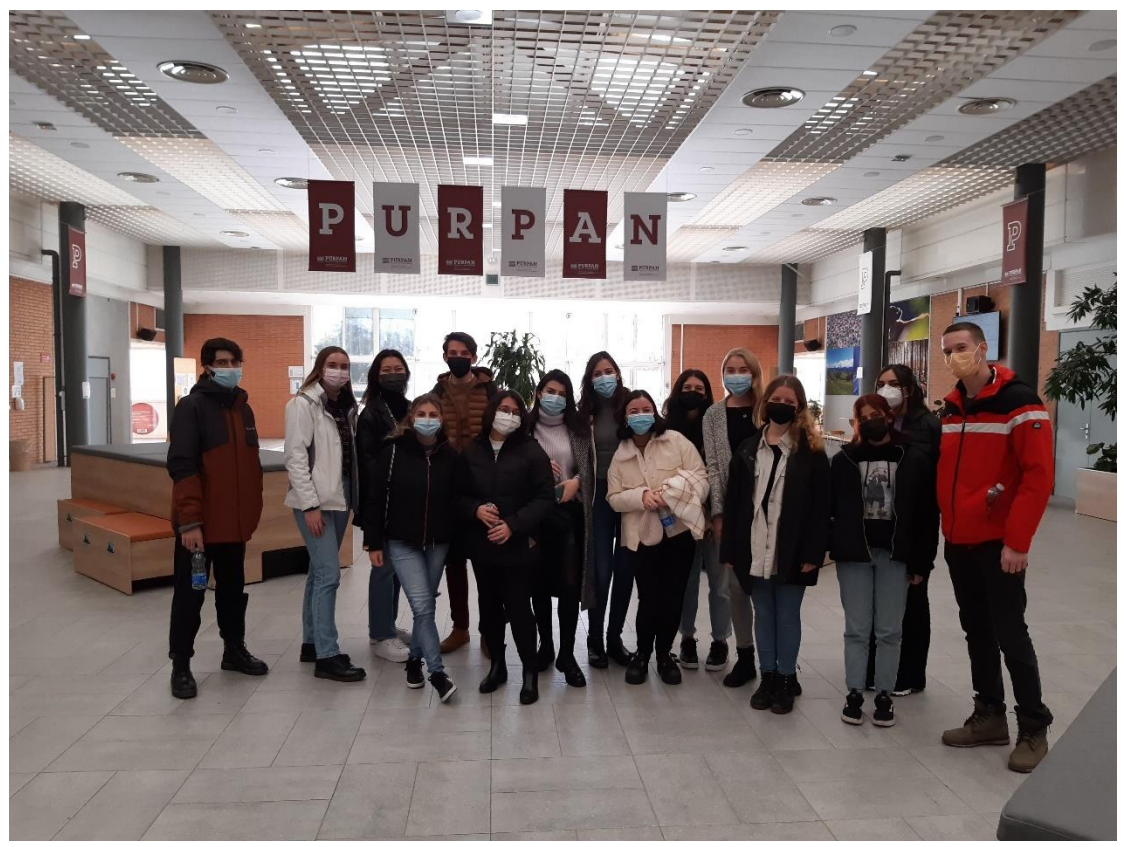
Two outgoing Erasmus students among the PURPAN group in Toulouse, France