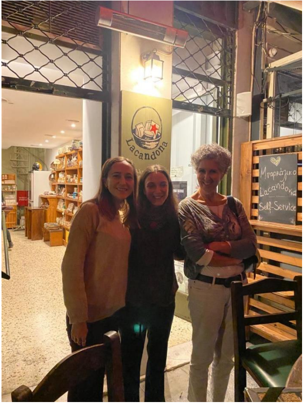
Invited lecturer from Istanbul Technical University (ITU)