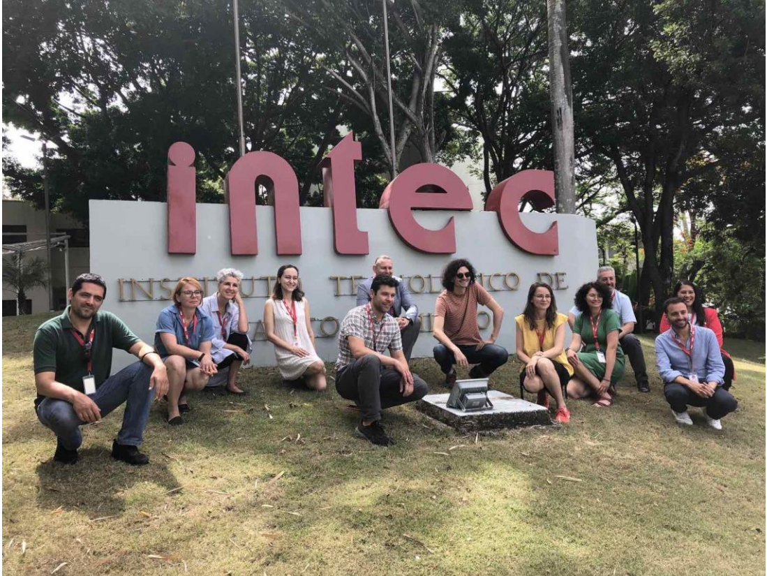
Erasmus mobility at INTEC, St Domingo