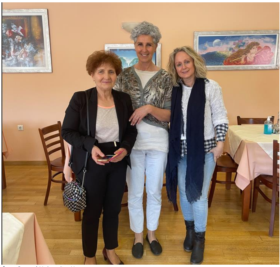
from Szeged University, Hungary