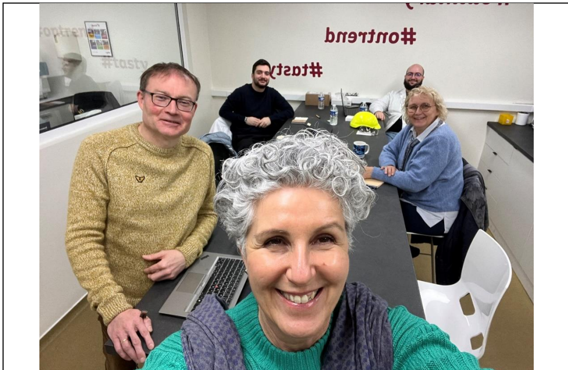
Kellanova/Kellogg: Dissertation thesis pre-assessment, manuscript structure